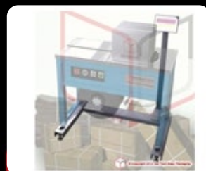
Retro Fit Scale