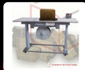
Ergo Strap Table